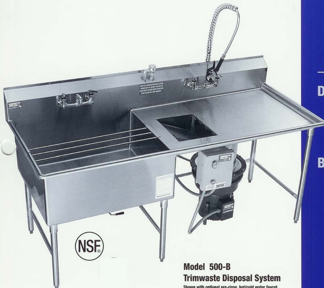
Model 500-B Trimwaste Disposal System

Shown with optional pre-rinse, hot/cold water faucet, and tub crate rack